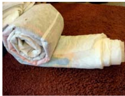
#3 & #4: making the “jelly roll” of rolled fabric in pellon