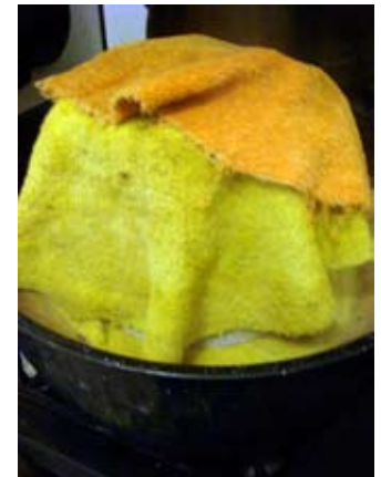
#5 & #6: fabric roll on towel and 1 paper circle, on rack in pot, then covered with 1 or 2 more towel circles and 2 paper circles before adding cover.