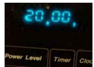
#7 pot on stove, #8 damp towel stuffed in open area to prevent steam from escaping, #9 timer