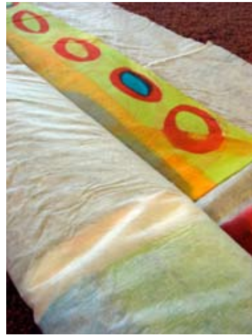
#1: laying out fabric on pellon. I zig-zag several lengths of pellon together to make one long and wide piece. #2: rolling up the fabric in the pellon, always pellon in between.